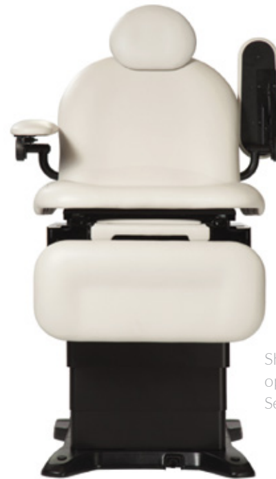
Shown with options (047 Self-Leveling Arms)