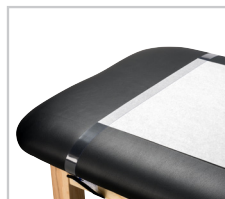
040 Paper Cutter