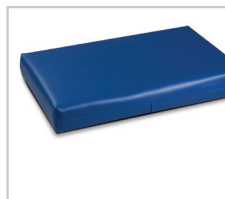
060 Large Pillow