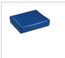
020 Small Pillow