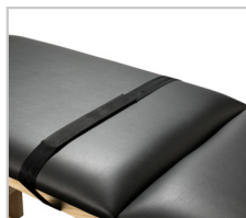
077 Safety Strap